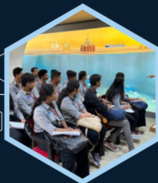
Sub-sea Lab Visit