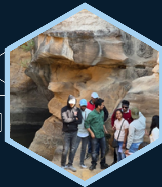
Field Work (Kutch)