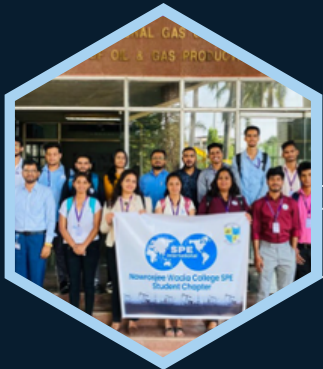
Visit to ONGC