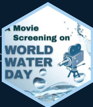
World Water Day